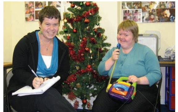
Members of STEPS learn how to adapt toys for children with disabilities.

The groups will provide services like debt advice, counselling, training and skills development courses. The STEPS group received a grant